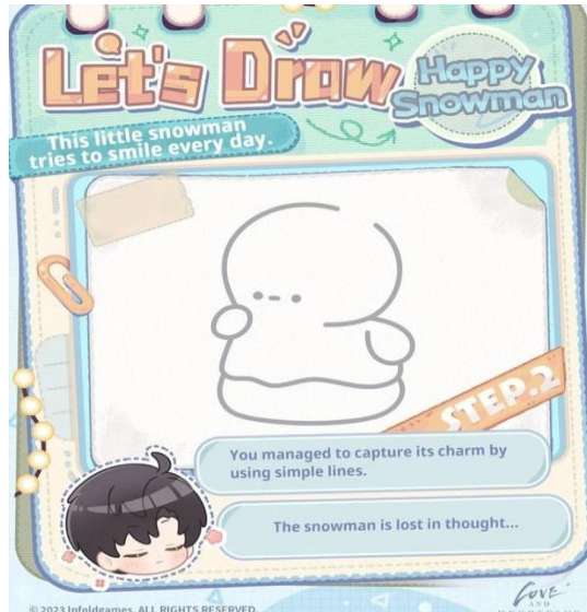
Figure 4.5 Zayne Drawing Snowman