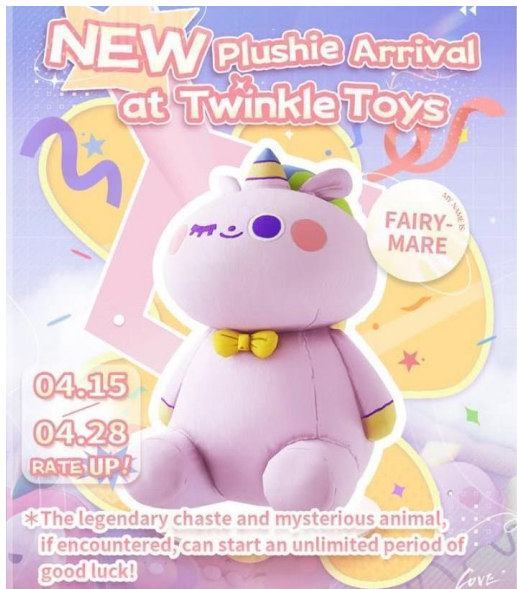
Figure 4.6 Fairymare Plushie