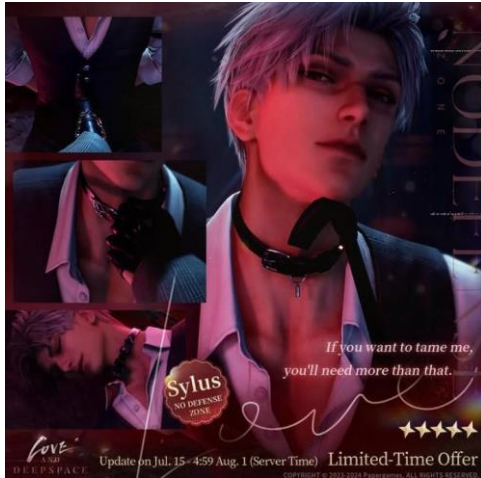
Figure 4.2 Sylus No Defense Zone