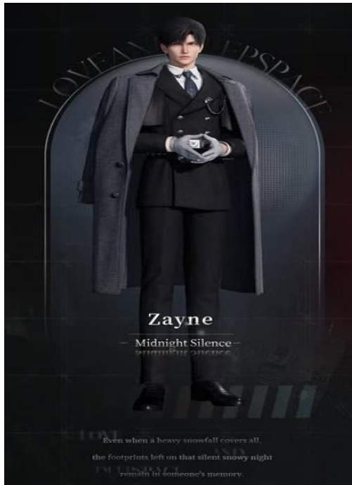
Figure 4.7 Zayne Midnight Silence