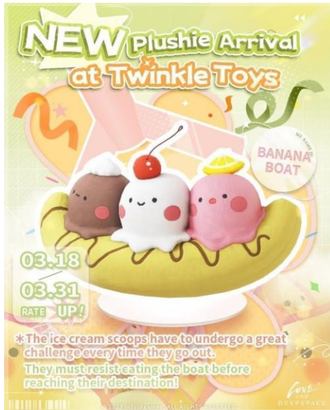
Figure 4.4 Banana Boat Plushie